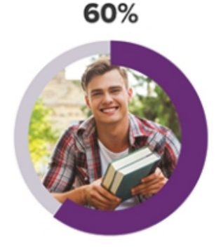
After financial aid package

Source: How America Pays for College, 2021, Sallie Mae